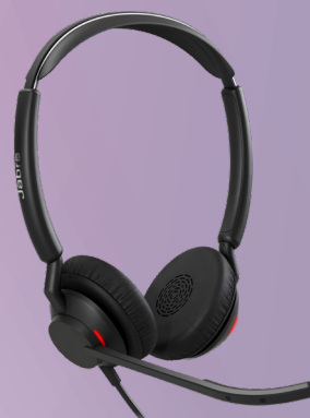
ENGAGE 50 II