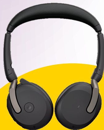
EVOLVE2 65 FLEX