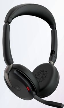
EVOLVE2 65 FLEX